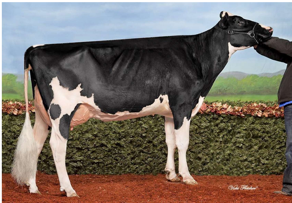
Mother: Ms Apples Uno Ambrosia VG 85